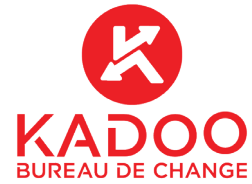
Kadoo Bureau Exchange